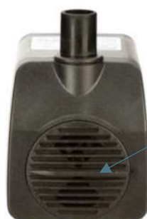
Water flow adjustor